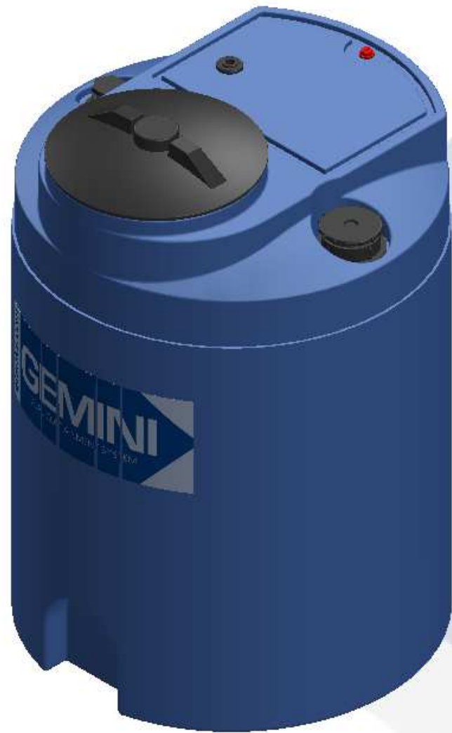
ISO VIEW (ASSEMBLED)